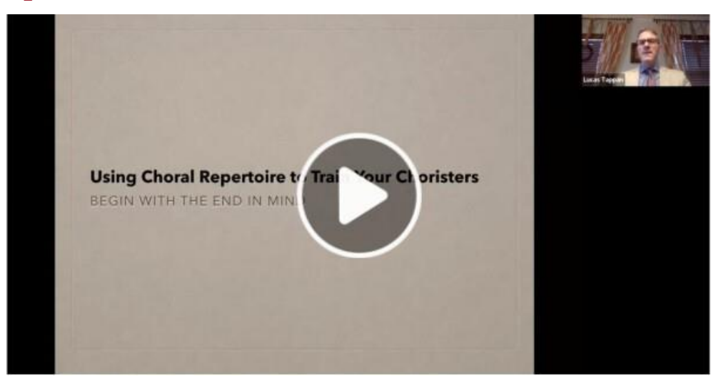
<u>Click here to watch our archived AFPC-NCEA webinars.</u> Stay tuned for one more webinar next month!