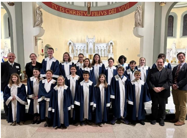
Pictured: Combined youth choirs of St. Peter's and St. Joseph's Church of Capitol Hill, Washington, DC

On the First Sunday of Advent, December 3rd, 2023, parishioners of St. Peter's Church on Capitol Hill and guests from The Papal Foundation were treated to the combined youth choir from St. Peter's and St. Joseph Church. It was a beautiful celebration of the Eucharist made even more beautiful by the presence of the singers from the American Federation of Pueri Cantores!