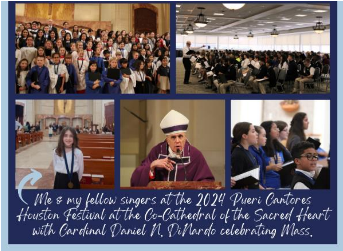
We & my fellow singers at the 2024 Pueri Cantores Houston Festival at the Co-Cathedral of the Sacred Heart with Cardinal Daniel N. DiNardo celebrating Mass.

Click here to sign up your child to be featured in a future AFPC newsletter.