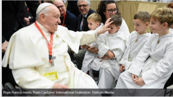
Pope Francis meets 'Pueri Cantores' International Federation

POPE POPE FRANCIS MUSIC ART AUDIENCES CHILDREN