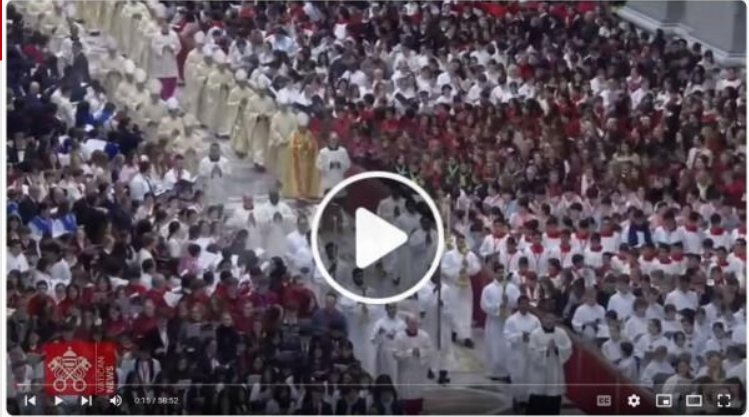
January 1 2024, Holy Mass for the Solemnity of Mary, Mother of God | Pope Francis

Pope Francis meets with young singers of the Pueri Cantores Federation, and praises choral singing as a joyful accompaniment to the prayer of the Church community.