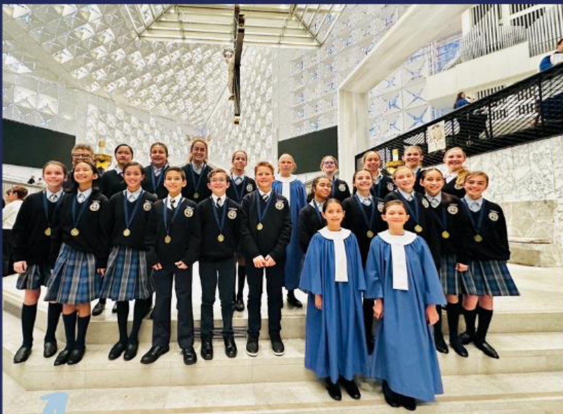
My choir and I at the 2024 Southern California Festival at Christ Cathedral, Garden Grove