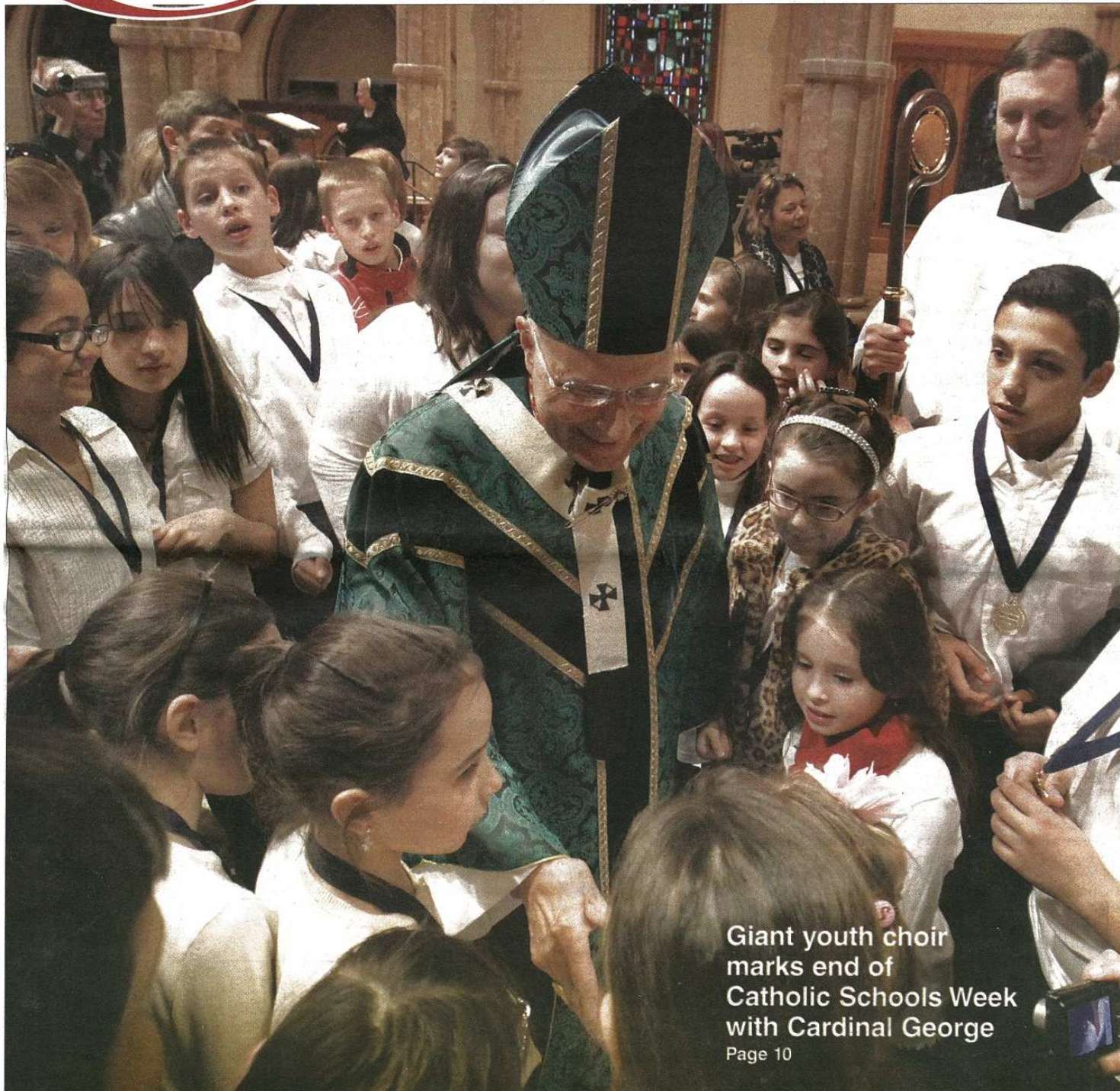
Giant youth choir marks end of Catholic Schools Week with Cardinal George Page 10