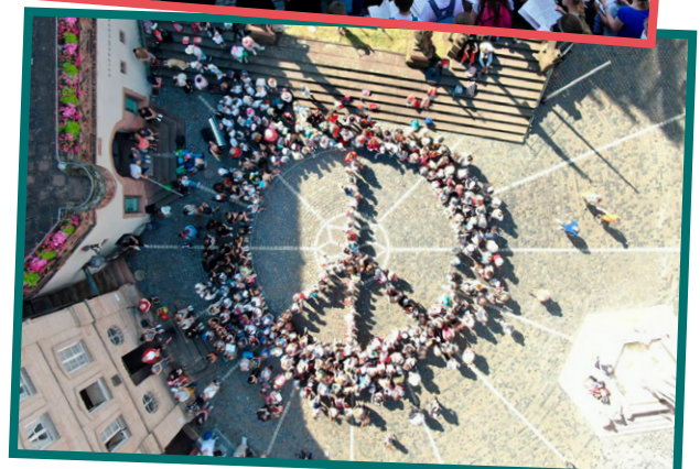
Pictures © Burkhard Vogt / POW Peace sign (drone picture) © Aschaffenburg Stiftemusik