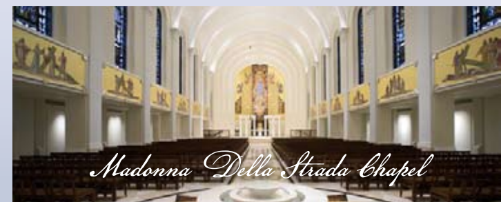
Madonna Della Strada Chapel