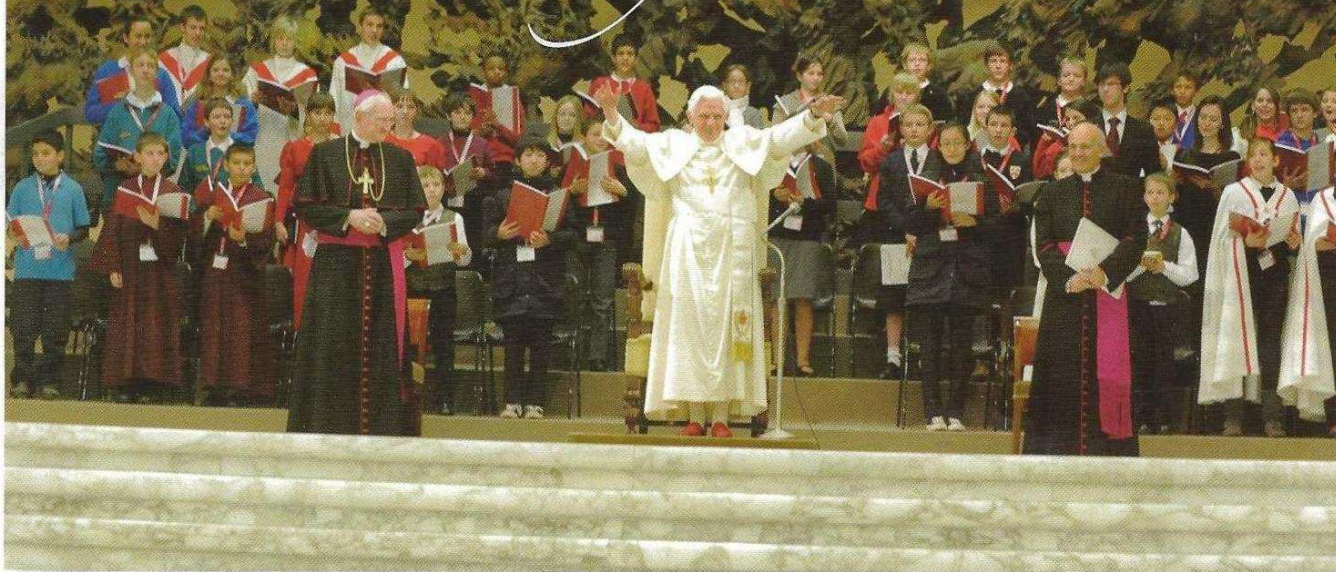
Pope Benedict XVI with singers during a rehearsal at the Sala Nervi , Dec. 30, 2010.